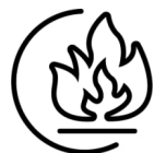
Fire Rated Carpet