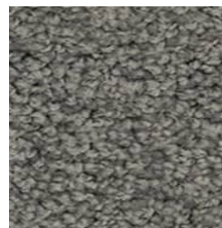
930 Grey Metal