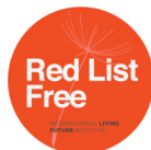
Declare® Red List Free