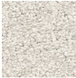
100 Soft Sand